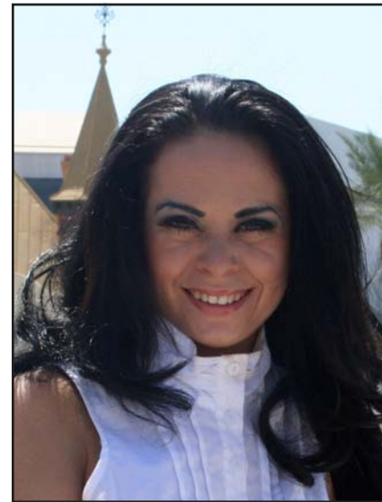
Louanna Faine Childhelp USA Keys Community Center